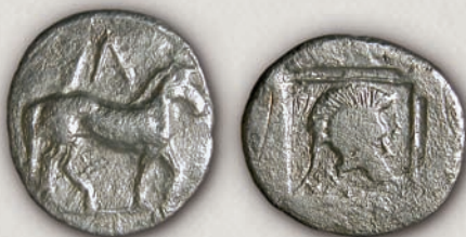
Alexander I, light tetrobol 476/75-460 BC

The history of the Macedonian royal coinage started with Alexander I Philhellene (498-454 BC). After the withdrawal of the Persians, around 480 BC, the political annexing of the areas of Crestonia, Bisaltia and Mygdonia to Macedonia started. The region that was populated by the Bisaltae covered the mountain of Disoron, well known for its rich mines which, according to Herodotus, were used by Alexander I to obtain one talent of silver per day (around 26 kg). Prior to 480 BC, the community of Bisaltae had issued coins whose representations remained the same after they joined the Macedonian kingdom; these coins, on whose reverse side the name of Alexander was added, are his first issues.