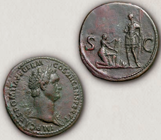
Domitian sestertius, Rome, 86 AD

In the course of II, and especially III century, the purity of the silver in the denarii was gradually diminished, which led to their devaluation. The monetary reforms of emperor Caracalla (211-217) in 215 introduced the antoninianus, a new silver coin named after the emperor – Mark Aurelius Antoninus. Besides the antoninianus, the gold aureus, billon denarius and bronze sestertii were also in circulation; the latter was last mined in the seventies of III century.