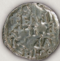
Marko, 1371-1395 dinar (reverse)