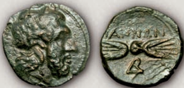
Dropion, bronze c. 250-230 BC

After the Celtic invasion in 279 BC, the territory of Paeonia was devastated and the economic situation did not allow minting of silver coins; therefore, king Leon (278 - c.250 BC) issued only bronze coins in several different denominations (19).