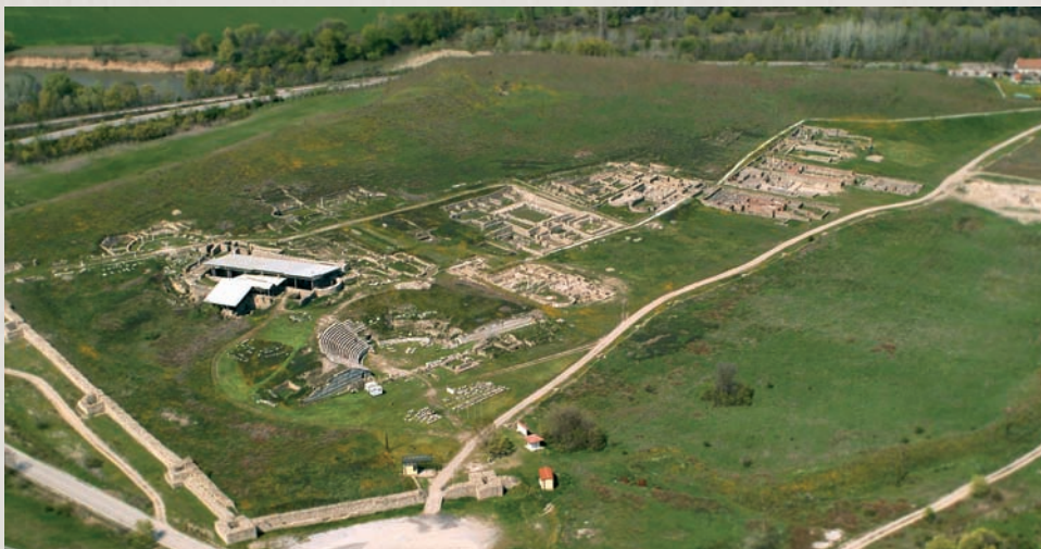
Aerial photo of the ancient Stobi

Out of the many cities that were granted right to issue coins in the Roman imperial period, Stobi is the only one that existed on the territory of the Republic of Macedonia. Because of this reason, the sub-collection of Stobi coins of the Numismatic Collection of the National Bank of the Republic of Macedonia is being constantly enriched, and today, with 2,500 specimens, it is the largest public collection of Stobi coins in the world.