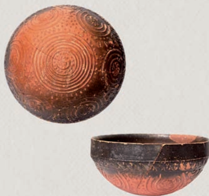
Moulded bowl Vardarski Rid, Gevgelia, end of the II / I BC