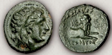
Leon, bronze 278-c.250 BC

At the beginning of his rule he had good relations with Macedonia, as it helped him in his fight against the Autariatae in 310 BC. In the period between 315 to 306 BC, the coins were minted according to the Paeonian weight standard; the representations