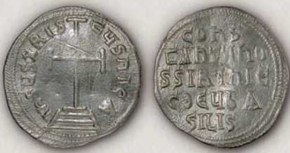
Constantine VI (780-797) miliaresion, Constantinople

Except for the miliaresion of Constantine VI (780-797), kept in our Collection, no other coins from the period before the first rule of Justinian II (685-695), until Theophilus, are known to originate from the territory of the Republic of Macedonia so far.