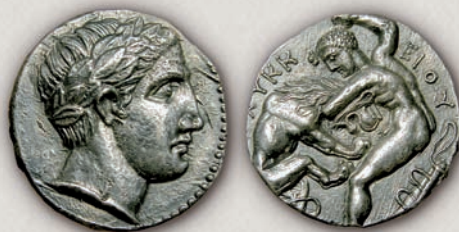
Lyceius, tetradrachm c. 359/58-c.340 BC

Lyceius (c.359/6 - c.340/35 BC) was the first Paeonian ruler who minted his own coins -- tetradrachms (10-11), drachms and tetrobols; he has been confirmed by written sources. The representations on his coins (Zeus, the struggle of Heracles with the lion of Nemea) point out to a connection with the Macedonian royal house, while the obverse representation of Apollo relates some of his tetradrachms types to the mints of Olynthus and Damastium.