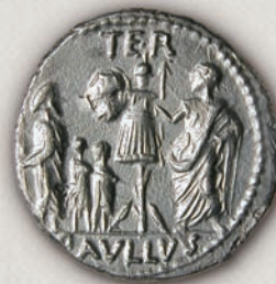
L. Aemilius Lipidus Paullus denarius (reverse), Rome

The victory of Aemilius Paulus over Macedonia was greatly celebrated in Rome, where the triumphant processions showed the spoils of war for three days; it consisted of a huge number of art works, pots with precious metals and money. According to Plutarch, the silver coins were carried in seven hundred and fifty pots, each containing three talents (1 talent = around 26 kg) and the gold ones in seventy seven pots of three talents each. The abundant spoils of war enriched the Roman state so much that the people did not pay certain taxes until 43 BC.