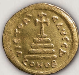
Tiberius II, solidus (reverse) Constantinople, 578-582

From an iconographic aspect, Justin II replaced the reverse image of an angel with the pagan representation of Constantinople with a globe surmounted by a cross, the last being the only Christian symbol present on the gold solidi (835). The obverse of the folleses and half-folleses is recognisable for the representation of the ruling couple (839-840). Sophia is the first woman whose stylized face is on Byzantine coins and also the first empress presented alongside the emperor. Formally, the right to be present on the copper coins, she provided by giving a birth of a boy.