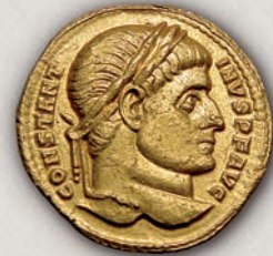
Constantine I solidus (obverse), Arl, 313 AD