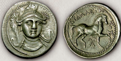
Audoleon, tetradrachm before 305 BC

on his earlier drachms were close to those of Patraus (portrait of the king on the obverse and a forepart of a boar on the reverse). One tetrobol type has a representation of Diumysus on its obverse, instead of the usual representation of Athena. In 306 BC, Audoleon, following the example of the Diadochi took the title basileus and started to issue tetradrachms according to the Attic weight standard; typologically, they were the same as those of Alexander III of Macedon, which was also typical for the heirs of Alexander. The good relations with Macedonia were interrupted in the time of the Macedonian dynasty of Antigonides. In 289/88 BC, when Antigonos Gonatas conquered the main port of Athens, Audoleon provided the city with grains and therefore the assembly made a decision to grant him and his heirs Athenian citizen right, and his bronze statue as a horseman was placed at the Agora.