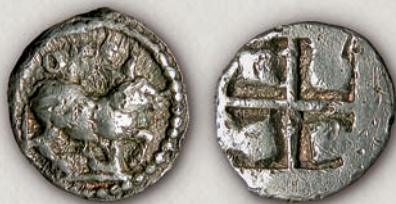
Orrescii, trihemibol, 490-480 BC

At the end of VI century BC and in the course of V century BC, the tribes that inhabited the regions of Paeonia, Macedonia and Thrace entered a monetary union; namely, their coins were minted in a same weight standard, they had the same denominations and an iconography which was similar, but still with separate features which expressed their own religion and everyday life. The coins that were minted before 480 BC had representations only on their obverse, while the reverse consisted of an imprinted incuse square, a stamp that was created in the course of their minting.