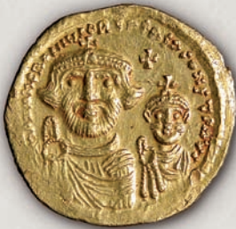
Heraclius, solidus (obverse) Constantinople, 616-625

Representations on the solidi and folleses of Heraclius (610-641) from the first years of his rule do not contain the military attributes and the civilian garment (chlamus) (859) was introduced, which was later again replaced by an armour and helmet on the copper coins. The reverse of the gold coins again had the cross, established by Tiberius II Constantine.