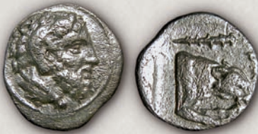
Archelaus, obol 413-399 BC

Regarding his monetary policy, Archelaus remained noted for the reforms that changed the weight standard, i.e., he introduced the so-called Lydian-Persian standard as a basis for the monetary system, with local features included. Besides this, large denominations in silver were reintroduced, to meet the needs of the foreign trade. For the local market, smaller silver denominations were minted, as well as bronze coins, which were first introduced in 400 BC.