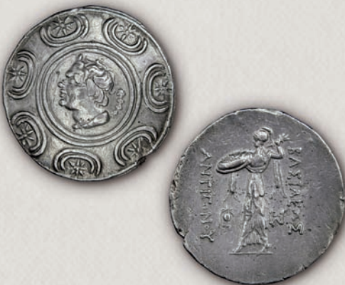
Antigonus II Gonatas tetradrachm, Amphipolis, after 271 BC

Following the example of his predecessors, Philip III issued gold staters, silver tetradrachms (141), drachms (142, 143) and bronze nominals (144), while it seems that king Cassander issued only bronze coins in his name (145-151). The need for larger denominations was met by the issues of the posthumous coins of Philip II and Alexander III.