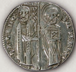
Raniero Geno (1253-1268) grosso (reverse), Venice

The Venetian grosso (941-944) that was introduced in the time of doge Enrico Dandolo (1192-1205), with his stable weight of 2,17 g and unchangeable fineness of the silver of 98,5%, became a dominant means of payment throughout the Mediterranean.