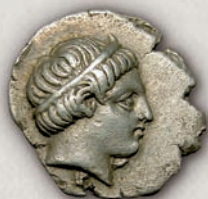
Patraus, drachm (obverse) c. 340/35-315 BC

The Numismatic Collection of the National Bank of the Republic of Macedonia also possesses a unique tetrobol with a lion on its obverse, and a wolf on its reverse; The presence of the wolf on this coin has been related to the etymology of the name of Lyceius, but also with the Apollo's epithet Lyceius (wolf's).