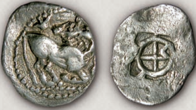
Ichnaei, trihemiobol 500-480 BC