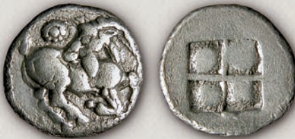
Mygdonia, diobol 500-480 BC

A recognisable representation on the Ichnaei coins is the wheel with four spokes. In the Linear B script, the same sign designated the word wheel – the object that occurred as a significant technological innovation in Europe in the middle of the second millennium BC. The wheel, as part of the Sun-cart, has been brought into relation with the solar cult and it is known as a sun wheel. This universal sign is one of the oldest religious symbols in the world.