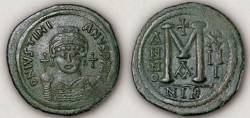
Justinian I, 40 nummi Nicomedia, 539-540

Justinian I was a Christian, convinced in the divine origin of his power, which can especially be noticed on his reformed solidi on whose obverses the emperor holds a globus cruciger instead of a spear, as a symbol of the divine cosmic power of the emperor. The presentation of the globus cruciger also conditioned the turning of the three-quarter to an face bust on the solidi (801-806), i.e. from a profile one to an an face one on the larger copper denominations (814-822). Another significant change resulted from the reforms of 538, the introduction of the indictional year on the reverse of the copper coins, as implementation of the law adopted the previous year.