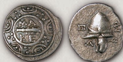
Autonomous issue tetrobol, 187/6-174/73 BC

The most typical motif used by the majority of rulers of Antigonid dynasty was the Macedonian shield, which was a national pride and symbol of their ethnic identity. Besides its representation on the coins, the image of the shield was often used to decorate the objects for everyday use, moulded pots, dishes, weights (III-II century BC.), which confirms its large popularity.