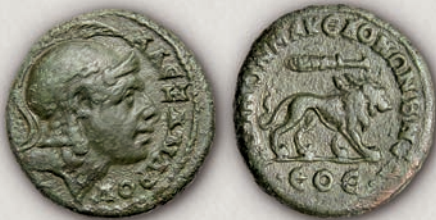
Pseudo-autonomous coin of the Macedonian koinon bronze, time of Gordianus III, 238-244 AD

In the time of Augustus (31 BC - 14 AD), the provincial bodies that were expected to promote the emperor's cult were either renewed or organised. The four merises were organised in a Macedonian koinon (community), headed by a priest, who was responsible for the public games organized to promote the emperor's cult. These games took place at the annual assembly in Beroia, the administrative centre of the Macedonian koinon, but in Thessalonica as well. The community had the right to issue its coins and probably bronze coins without emperor's portrait were minted in Thessalonica, with the inscription ΜΑΚΕΔΟΝΩΝ (352-354), as well as coins with the emperor's portrait and his title on the obverse, with the inscription ΣΕΒΑΣΤΟΣ ΜΑΚΕΔΟΝΩΝ, ΜΑΚΕΔΟΝΩΝ on the reverse (355-357), while the inscription ΚΟΙΝΟΝ ΜΑΚΕΔΟΝΩΝ (358-367) was introduced at the time of Vespasianus (69-79).