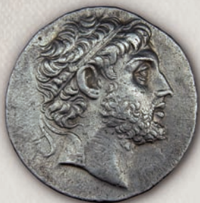
Philip V, tetradrachm (obverse) Pella or Amphipolis, c.220-211 BC

Philip V (221-179 BC) came to the Macedonian throne after the death of his father Demetrius II (230/29 BC), when he was only nine, and thus, the rule of the country was undertaken by Antigonus Doson (229-221 BC.). In 221 BC, Antigonus was killed in the battle with the Illyrians, and Philip V came to the Macedonian throne.