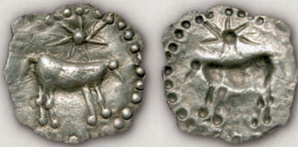
Derrones, hemiobol after 480 BC