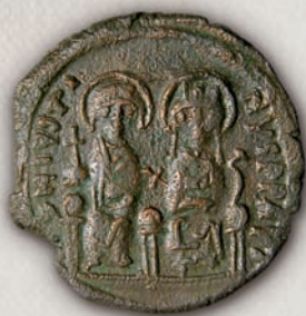
Justin II, 40 nummi (obverse) Constantinople, 569-570

From an iconographic aspect, Justin II replaced the reverse image of an angel with the pagan representation of Constantinople with a globe surmounted by a cross, the last being the only Christian symbol present on the gold solidi (835). The obverse of the folleses and half-folleses is recognisable for the representation of the ruling couple (839-840). Sophia is the first woman whose stylized face is on Byzantine coins and also the first empress presented alongside the emperor. Formally, the right to be present on the copper coins, she provided by giving a birth of a boy.