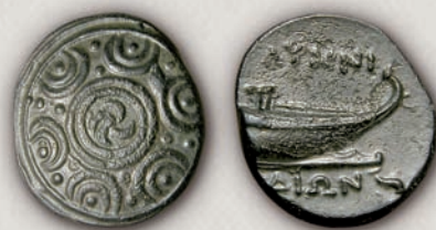
Lychnidos, bronze, 187-171 BC

The bronze coins of Lychnidos are exceptionally rare and taking into consideration the fact that only thirty specimens have been registered so far, one can assume that they were primarily intended for local use only.