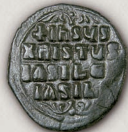
Anonymous follis (reverse) Constantinople, 976(?) - 1030/35

During the reign of Constantine X (1059-1067), the image of the emperor, alone or accompanied by Christ (885) or Holy Mother of God, was reintroduced in the Byzantine numismatic iconography. These coins were in parallel circulation with the anonymous folleses until 1091.