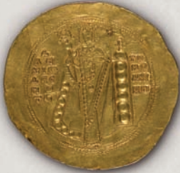
Alexios I Komnenus hyperpyron, (reverse) Thessalonika, 1092/93-1118

It is evident that the circulation of coins on the territory of the Republic of Macedonia was increased in the second half of XI century, and one of the reasons laid in the fiscal reform of 1042 that was undertaken by the brother of emperor Michael IV the Paphlagonian (1034-1042), which replaced the tax in kind with a tax in money. Besides this, the increased monetarisation can also be explained by the break-down of Samuel's state and the reestablishment of the Byzantine control over the Macedonian territory, as well as with the inflation processes that intensified in this period.