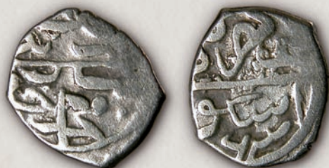
Bayazid II (1481-1512) akçe, Skopje

After the battle of Černomen at Marica River in 1371, the Ottoman attacks in the Balkans were intensified. Until the end of XIV century, the territory of Macedonia was under Ottoman rule, and in this way the Ottoman monetary system coins entered in circulation. A number of mints were opened all over the Empire, and they were to meet its economic and fiscal needs.