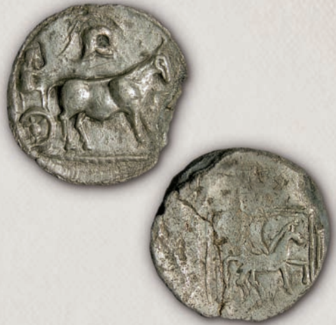
Laeaei, oktodrachm after 480 BC

The larger denominations most often include representations of man and bovine. With the Derronian and Laeaeian specimens (3), certain local deities or perhaps the rulers themselves in a cart drawn by a bovine are present. The sun, helmet or a plant motif, which are often part of the obverse composition, could possibly represent the mint marks.