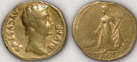
Octavian August aureus, Lugdunum, 11-10 BC

Although the gold aureus was introduced in 84 BC, its more intensive emissions occurred only in the time of Octavian August. The aureus, the silver denarius, the bronze sestertius, the dupondius, the as and the semis were the demonations that remained in circulation for around 20 years. Medallions that were not intended for regular circulation were also minted on various occasions (509).