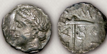
Damastium, tetrobol c. 350/45-330 BC

At the time of the last Paeonian king Dropion (ca.250 - 230 BC) a community (koinon) of the Paeonians was established. The bronze coins with a portrait of Zeus on this obverse and a winged lightning with the inscription ΠΑΙΟΝΩΝ and monogram ΔΡ on the reverse (20, 21), have been attributed to this king.