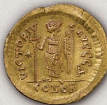
Justin I, solidus (reverse), 518-522

The coins that were minted in the time of Justin I had the same iconography as the coins of his predecessor (790-797). The only change happened in 522, when the female representation of Victoria on the reverse side of the Constantinopolitan solidi was transformed into a male angel by a simple removal of the belt of her hiton .