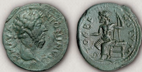
Mark Aurelius, II denomination Stobi, 161-180 AD

The Roman town of Stobi is situated near Gradsko, at Veles, on the spot where Crna River flows into Vardar. The archaeological researches have shown that the life in the ancient settlement took place in continuation in the period from VII to VI century BC, and up until the end of VI century AD. In the the Roman period, Stobi was the largest city in the province of Macedonia Salutaris (later Macedonia Secunda); The significance that the Roman community living at Stobi had, is marked by the fact that the city obtained a municipal status in 69 AD, whereby its citizens received ius Italicum , becoming so Roman citizens.