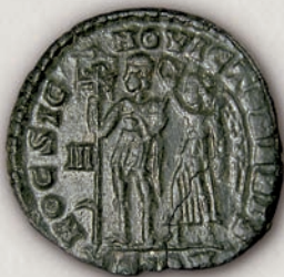
Constantius II, nummus(reverse) Sirmium, 351-355 AD

After the Edict of Milan was signed in 313 by Constantine I (655) and Licinius I (641), Christianity was officially proclaimed as a religion equal to other religions in the Empire. The Christian symbols gradually entered the monetary iconography. In the beginning they were small symbols, most often the Christogram (Christ's monogram) placed sometimes on the military sign (705, 706, 709, 711, 713 and 714), but sometimes filling the complete reverse side on the coin. Cross, the most recognisable Christian symbol today, appeared in the monetary iconography as late as the V century. On the coins of Magnentius and Constantius II, the Christogram was sometimes combined with the letters "alpha" and "omega" as an allusion of the writings in the Revelation to John that the Christ is alpha and omega, i.e the beginning and the end. There is a discrete presence of Christian iconography on the coins, too, for example noticeable in the representation of Constantine I with his head lifted (670) as it should probably imply a man praying.