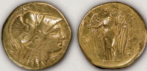
Alexander III of Macedon, distater, Amphipolis, c.330-320 BC

The power of Alexander of Macedon, as well as the purity of the metal his coins were minted from, made these coins to become commonly accepted international means of payment.