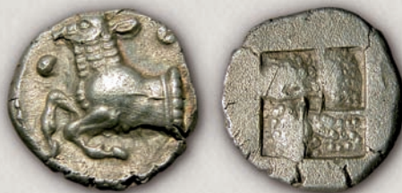
Derrones, triobol 500-480 BC

So far, coins of the tribes Derrones (1, 2), Laeaei (3), Orrescii, the cities of Ichnaei (which can probably be attributed to the tribe Ichnaei) and Lete, as well as coins probably minted in the regions of Crestonia or Mygdonia have been found on the territory of the Republic of Macedonia.