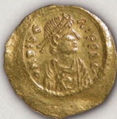
Maurice, tremissis (obverse) Constantinople, 583/4-602

The period of the rule of Emperor Maurice (582-602) (847-850) was marked by constant wars that drained the state treasury, because of which he was forced to increase the taxes. There was the war with Persia on the one hand, and the incursions of Avars and Slavs who crossed the Danube Limes more and more frequently and devastated the Byzantine Empire, on the other, all this evidenced by the large number of VI century coin hoards that are being discovered nowadays. The largest hoard of solely early Byzantine copper coins in the world so far is kept in the Numismatic Collection of the National Bank of the Republic of Macedonia. It contains 1,023 specimens and it was buried around 583/84 in the high point of these incursions. The historian Eugarius, who was a contemporary of the events taking place in the time of Maurice, says: "... the Avars reached the Great Wall twice; they have conquered and robbed Singidinum, Anchialus, the whole Hellada and other cities and fortresses, destroying and burning everything because the big army was at the east..."