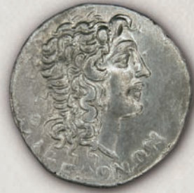
Aesillas, tetradrachm Thessalonica, c.90-70 BC