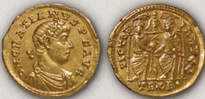
Gratian solidus, Treveri, 367-375 AD

It is assumed that the bronze nummi introduced by Constantine I in 317-18 were called centenionals. With the reforms of Constantius II and Constans in 348, they were demonetised, and heavier nummi (AE 3) were introduced, possibly being named majorina.