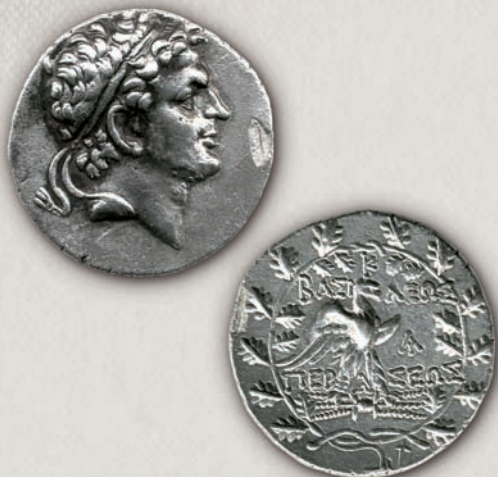
Perseus, tetradrachm, 179-168 BC

The Third Macedonian War (171-168 BC) was decisive in the final decision on the political future of Macedonia. In order to strengthen his position in the kingdom, Perseus (179-168 BC), a son and heir of Philip V undertook diplomatic activities that renewed the relations with Greece and an alliance with the Seleucides in Asia was made. In 172 BC he was accused by the Roman senate for having planned to subjugate Greece under the Macedonian power and in 171 BC, the war was announced. In the beginning, the Macedonian phalanx was successful and the Roman legion was defeated in 169 BC, but after Aemilius Paulus took the command, Perseus lost the war on 22 June 168 BC.