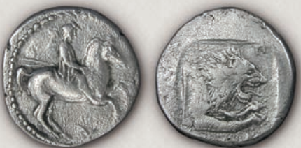
Perdiccas II, heavy tetrobol 437/6-432/1 BC

During his rule, Perdiccas II (454-413 BC) introduced wise and flexible policies, arranged alliances that were accorded with the current political situation, thus managing to preserve the territorial integrity of his kingdom. He minted only silver coins of smaller value – heavy and light tetrobols (93-98a), diobols and obols, probably due to the lack of silver that he was facing, but also because of the need for more intense monetization of the economy.