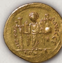
Justin I, solidus (reverse), 522-527 r.