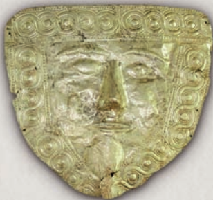
Burial mask of local female ruler, VI/V century - Ohrid, Museum and Institute - Ohrid

The first coin production on the territory of the Republic of Macedonia could be traced at the end of VI century BC, when the Paeonian tribal communities started to mint their silver coins, only a century after the first appearance of the coins in the world.