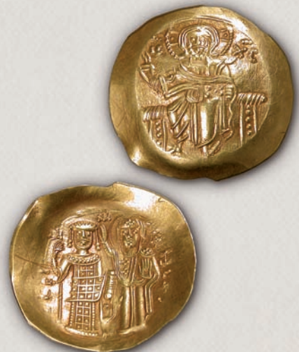
John III Duca Vatzes hyperpyron (reverse) Magnesia, 1232-1254

At the time of John III Doukas Vatatzes (1222-1254) (924, 925), the territory of the Nicaean Empire was doubled in size. In order to strengthen the economy, this emperor tried to develop local economy and he prohibited the purchase of luxury products of foreign origin. Everybody was to cope with “what the Roman soil bore and the Roman hands produced”, while the emperor tried to confirm this with his own example, and the crown of the queen was made with the coins earned from sale of eggs from the imperial property.