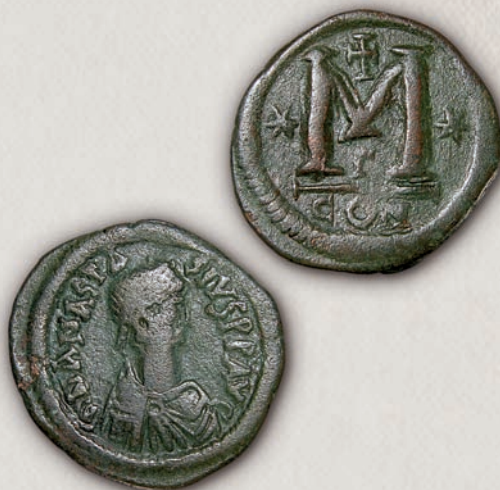
Anastasius I 40 nummi, Constantinople, 512-517

The beginning of the Byzantine numismatics is most often related to the reforms of Anastasius I (491-518) in 498, which introduced new copper coins, while the gold coin minting remained unchanged, and gold solids were in circulation (779-783), along with semisses and tremisses (784). Besides the drastic increase of weight in relation to the late Roman coins, the new copper coins also obtained a mark on the reverse that was intended to designate their nominal value. Using the Greek numerical system, the following letters were employed: "M" (40 nummi) on the follis (785-786), "K" (20 nummi) on the half-follis (788-789) and "I" (10 nummi) on the decanummium. The reforms of 512 doubled the weight of the copper coins, and a new denomination of 5 nummi was added, marked by "E" (789). The coins were minted in four mints: Constantinople, Thessalonika, Antioch and Nicomedia.