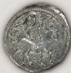
Volkašin, 1365-1368 dinar (obverse)

Besides the coins of the rulers, in the end of XIV century there were city mints that occurred. Skopje, a significant military and trade centre at that time, started issuing its own dinars around 1395, with the name of the city on them.