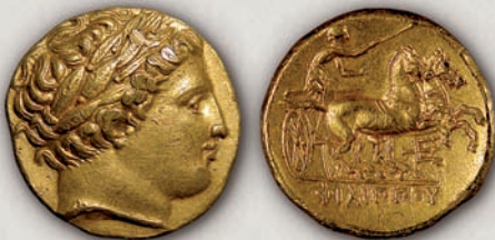
Philip II of Macedon, stater Pella, c.340-c.328 BC

Soon after his coming to power, the minting of Philip's silver coins started in Pella, and around 357/56 BC in Amphipolis as well (105). With his monetary reforms that were implemented in 345 BC, Philip II introduced a gold denomination for the first time in the history of Macedonia. The gold stater (104), as well as its fractions: 1/2, 1/4 (104a), 1/8 and 1/12 from the stater, were minted in the same mints. The Attic weight standard was used for the staters, while the local Macedonian one for the tetradrachms.