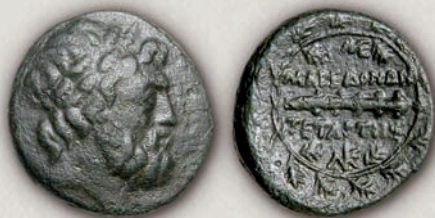
Fourth Macedonian Meris, bronze, Pelagonia, 167-149 BC

In the same period, Amphipolis, the centre of the First Meris, started issuing tetradrachms with the representation of Zeus on the obverse and Artemis Tauropolos with the inscription MAKEΔONΩN ΠΙΠΟΤΗΣ on the reverse. After the mines were reopened in 158 BC, the coin production at Amphipolis was significantly increased (217-222), and silver tetradrachms were also minted in Thessalonica, the centre of the Second Meris. These tetradrachms had a representation of Artemis in a Macedonian shield on the obverse, and Heracles's club on the reverse, with the inscription MAKEΔONΩN ΠΙΠΟΤΗΣ in an oak wreath. No coins from the centre of the Third Meris, Pella have been registered so far.