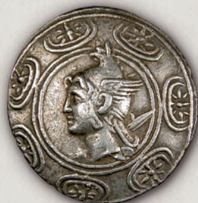
Philip V, tetradrachm (obverse) Pella or Amphipolis, 211-197 BC

This Macedonian king minted staters, tetradrachms, didrachms, drachms (159-161), hemidrachms and bronze coins (162-184). His earlier tetradrachms bore his portrait on the obverse, while on his later issues this image was replaced with a representation of the Macedonian shield in the centre of which the mythic hero Perseus was placed.