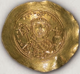
Constantine IX Monomachos nomisma histamenon, (reverse) Constantinople, 1042-1055

At the end of X century and beginning of XI century, the territory of Macedonia was the core area of the Samuel's Empire. Emperor Samuel (997-1014), first from Prespa and then from Ohrid ruled a huge territory, which included and the current neighbouring countries. Despite his great power, Samuel did not mint his own coins, and this would not be surprising if one takes into consideration that none of the first medieval rulers of the empires that were created in the Balkans issued coins, too. Instead, official coins of the Byzantine Empire were used on their territories.