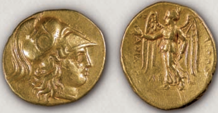
Philip III Arrhidaeus stater, Babylon, 323-317 BC

After the death of Alexander III, the posthumous coins of Philip II and Alexander III circulated on the territory of Macedonia, together with the coins of king Philip II Arrhidaeus (323-317 BC) and Cassander (316-297 BC).