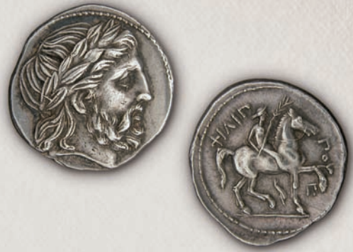
Philip II of Macedon, tetradrachm Amphipolis, c.323/2- c.316/5 BC

One of his first successes in 357 BC was the conquest of the city of Amphipolis, a significant strategic point that was controlling the road to Thrace; what is even more important is that the city was near the Mount Pangaeum, rich with gold and silver ore.