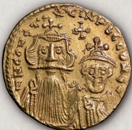
Constans II, solidus (obverse) Constantinople, 651/2-654

In the course of VII century, the circulation of copper coins in relation to the gold and silver denominations decreased at the whole territory of the Byzantine Empire (because the silver minting in VI century was pretty neglected, in 615 a silver hexagram was introduced, as a unit between the gold tremissis and the copper follis). There are 10 specimens of copper coins from the territory of the Republic of Macedonia, part of a hoard with twelve silver hexagrams and part of a hoard with 32 gold solidi and tremisses that is kept in the Numismatic Collection of the National Bank of the Republic of Macedonia, stored at the time of Constans II (641-668). One of the reasons for the decreased circulation of coins was certainly the contemporary monetary policy. In this period, there were five mints, and Constantinople was the only one that was active in the Eastern part of the Empire; the other four Sicily, Ravenna, Rome and Carthage were in the Western part.