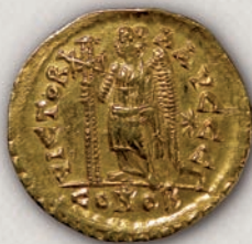
Leo I, solidus (reverse) Constantinople, 462 or 466 AD