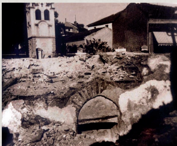
Remains of the mint of Skopje (photo taken after the Skopje earthquake of 1963)

The minting of Ottoman coins in Macedonia lasted for around 170 years, until the middle of XVII century when the sultan Ibrahim (1640-1649) closed all provincial mints in the Balkans. The reason for their closing was the permanent decrease of the quality of the coins, as well as their forging.