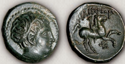
Philip II of Macedon, posthumus bronze, Amphipolis

Soon after his coming to power, the minting of Philip's silver coins started in Pella, and around 357/56 BC in Amphipolis as well (105). With his monetary reforms that were implemented in 345 BC, Philip II introduced a gold denomination for the first time in the history of Macedonia. The gold stater (104), as well as its fractions: 1/2, 1/4 (104a), 1/8 and 1/12 from the stater, were minted in the same mints. The Attic weight standard was used for the staters, while the local Macedonian one for the tetradrachms.