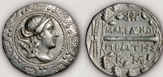
First Macedonian Meris, tetradrachm, Amphipolis, 158-150/49 BC