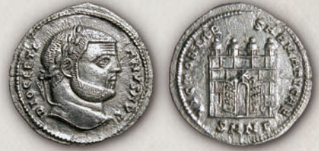
Diocletian argenteus, Nicomedia, 295 AD

In 309, Constantine I (306-337.) implemented a monetary reform again, introducing a new gold denomination, the solidus (654), and its fraction semissis. Around 324, two new silver monetary units -- miliarense and siliqua were added to the existing monetary system (700-702).