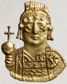
Bust of Justinian I solidus, (obverse), Constantinople, 542-552

Petrus Sabbatius or Justinian I (527-565) was born around 483 in Taurisium (Taor), near Skopje. As a nephew of Justin I, in 525 he was granted the title of Caesar, and on 4 of April 527 he was proclaimed Augustus and his co-ruler. Their co-ruling lasted for four months only, which is the reason for the rarity of coins minted in the name of this co-ruling (798). He remained remembered in history by his efforts to renew the Roman Empire, by the codification of the Roman law, as well as by the huge number of buildings he built around the Empire.