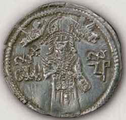
Stefan Dušan (1346-1355) dinar (obverse)

In the second half of XIII century, in parallel with the Venetian grossi in Macedonia dinars of the Serbian rulers were also in circulation (945-958). The Serbian medieval state started issuing its billon coins at the time of king Radoslav (1227-1234), but only after the conquest of the northern part of Macedonia by king Milutin in 1282, the silver issues became a dominant monetary unit in these areas. The Serbian dinars initially imitated the Venetian grossi, and from the first half of XIV century the dinars obtained a purely Byzantine iconography. Besides these changes, the inscriptions changed from Latin to Cyrillic.