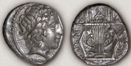
Chalcidice League, Olynthus tetrobol, 432/31-430 BC

His tetrobols and diobols had the same iconography as the coins of his father, but the obols of Perdiccas II for the first time included the representation of Heracles, the mythical ancestor of the Macedonians.