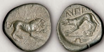
Lyceius, tetrobol c.359/58-c.340 BC

The Numismatic Collection of the National Bank of the Republic of Macedonia also possesses a unique tetrobol with a lion on its obverse, and a wolf on its reverse; The presence of the wolf on this coin has been related to the etymology of the name of Lyceius, but also with the Apollo's epithet Lyceius (wolf's).