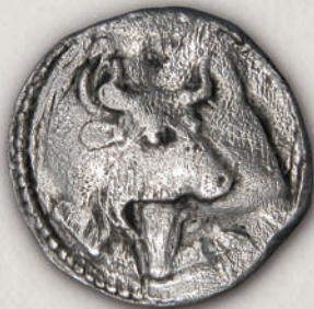
Olynthus, tetrobol (obverse) 424-380 BC

Among the first colonisers were the citizens from two poleis at the island of Euboea - Chalcis (Olynthus and Terone) and Eretria (Dichea, Mende (41-41a), Methone). Other poleis, such as Corinth (Potidaea) also started establishing their colonies soon. Colonisers from the island of Pharos were brought to the island of Thasos (28-30), and they later colonised the city of Neapolis (44-45). In the V century BC, until the middle of IV century BC, these colonies issued their own coins, and in this respect, autonomous coins were also minted by the cities of Acanthus, Amphipolis, Eion (38-40), Lete, Olynthus, Sermyle, Stageira, Tragilus (42-43) and others.