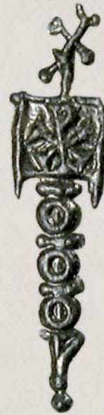
Christogram on labarum Constans II, nummus (detail) Siscia, 337-340

Besides the symbols related to Christianity, the coins of Constantius II, Vetranus and Constantius Gallus contain the inscription "Hoc signo victor eris" ("In this sign you shall conquer") (709). According to the legend told by the historian Eusebius, in his work "The Life of the Blessed Emperor Constantine" (Vita Constantini), before the battle of the Milvian Bridge Constantine I had a vision in which the sun turned into a cross, and then these words appeared. In the battle, the soldiers of Constantine I and Licinius I carried shields that were inscribed with Christ's monogram. Constantine took over a victory and in year 313 his well known Edict was signed.