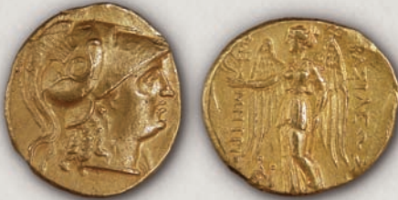
Demetrius I Poliorcetes stater, Pella, c.291-290 BC