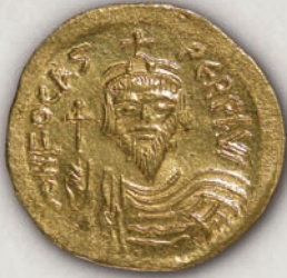
Phocas, solidus (obverse) Constantinople, 607-609

These situations lasted for quite a while and in the end, in 602, they ended with a rebellion led by the young officer Phocas. After becoming an emperor, Phocas (602-610) attempted to consolidate the state and one of the first steps that he undertook was to decrease the taxes. This was approved by Constantinople, but it soon became clear that the previous fiscal policy of Maurice was needed to be reintroduced because of the wars the Empire was involved in.