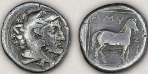
Amyntas III, didrachm 389-383 BC

The murder of king Archelaus in 399 BC marked the beginning of a forty-year period of political instability, caused by the frequent changes at the Macedonian throne. Some of the rare testimonies of this period are the coins of Aeropus II (398/7-395/4 BC) (99a), Amyntas (395/4 BC), Pausanias (395/4-393 BC) (100), Amyntas III (393-370/69 BC) (101-102) and Perdiccas III (365-359 BC) (103), which are also kept in the Numismatic Collection of the National Bank of the Republic of Macedonia.